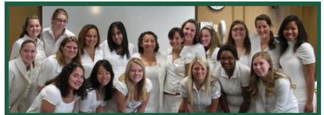
Delta Psi—Johnson & Wales University, Denver, CO

To sustain relationships that transcend the collegiate experience