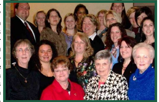
AST's of Houston dine out with National Council and Executive Director

Membership in Alpha Sigma Tau is for life...but what does that really mean? Alpha Sigma Tau is a constant thread in your life and she is there for you as much as you need her. She is there for you when you are in college, when you are starting a family, when you are moving to a new area, and when you are starting, changing or retiring from a career. She is with you during the highs and lows in your life. She gives you an amazing return on your investment in your membership. She understands when you have the time, energy and resources to contribute and she knows that everyone needs a break now and then. She will be standing by when you are ready to engage and she gives you plenty of opportunities to get involved.