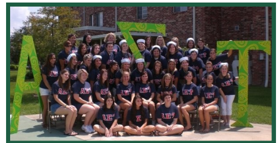
Phi Chapter, Recruitment 2009

As you learn more about the plan please be thinking of what role you might be interested in playing to support and implement it. Implementation will bring increased opportunities for member involvement at all levels of Alpha Sigma Tau.