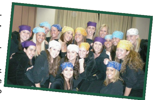
Delta Epsilon 2008 Greek Week Champions

Please also include the chapter name and the closest estimated date possible!